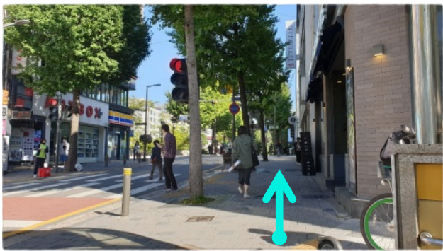
Subway exit 3 towards Ewha Womans University campus