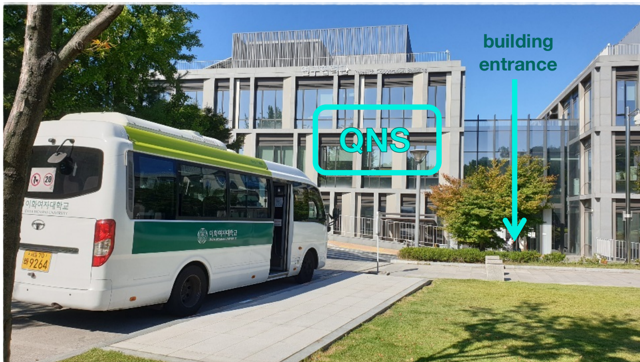
QNS at Ewha Womans University – Research Cooperation Building

For QNS, please get off the white shuttle bus (after ca. 8 min) at its final stop, i.e. Research Cooperation Building (연구협력관):