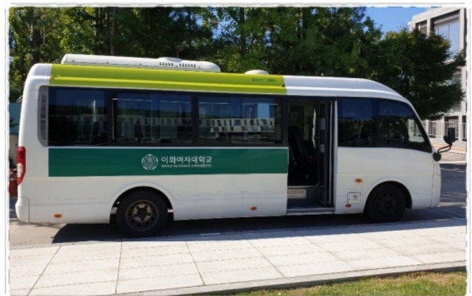
Ewha white shuttle bus