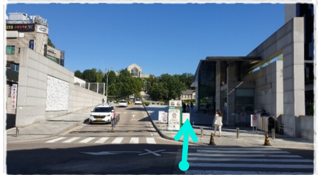
Main gate of Ewha Womans University campus