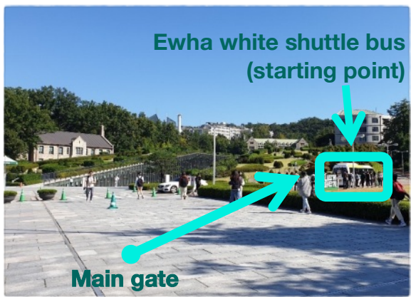
From the campus main gate to the starting point of Ewha shuttle

Once you reach the main gate of Ewha Womans University campus, please board the white shuttle bus (leaving every 10 min, with a break in operation from 12 pm to 1 pm) at its starting location: